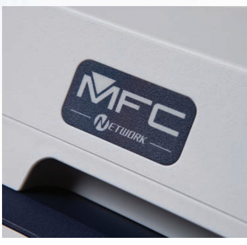
Built-in network capability.

There's more to the MFC-9120CN than professional colour print, fax, copy and scan performance. Discover the Top Ten easy to use solutions to save time and money in the office.