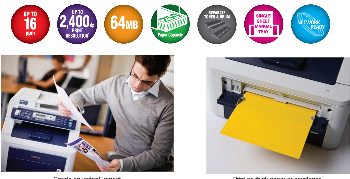
Create an instant impact - with up to 16ppm colour A4 printing.

* download free of charge from http://solutions.brother.com